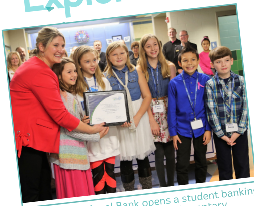
American National Bank opens a student banking branch at Lewis & Clark Elementary.