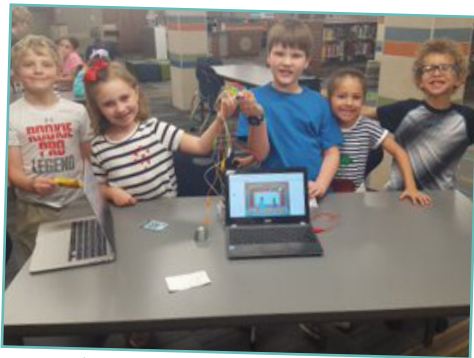
Lewis & Clark students learning about electricity & coding!

There are so many ways to Explore your Greatness at Lewis & Clark: